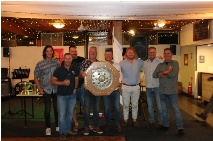
Members of Brighton and Seacliff Yacht Club receiving the Wales Shield